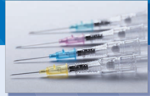
VanishPoint ® IV catheters are available in a variety of lengths and gauges

Push-off tab facilitates one handed advancement and indicates bevel orientation