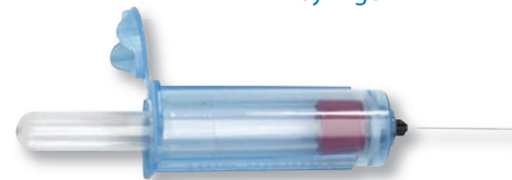
VanishPoint® Blood Collection Tube Holder